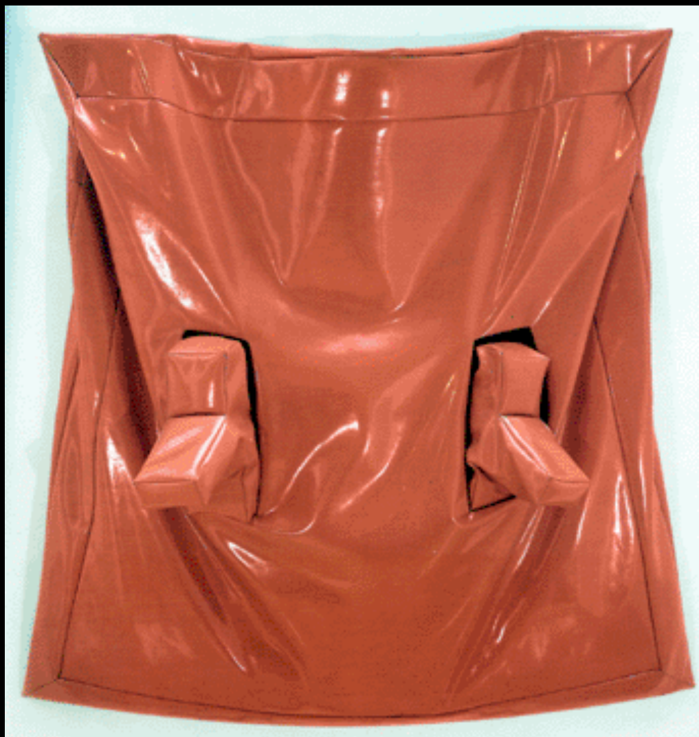
"Switches", soft sculpture